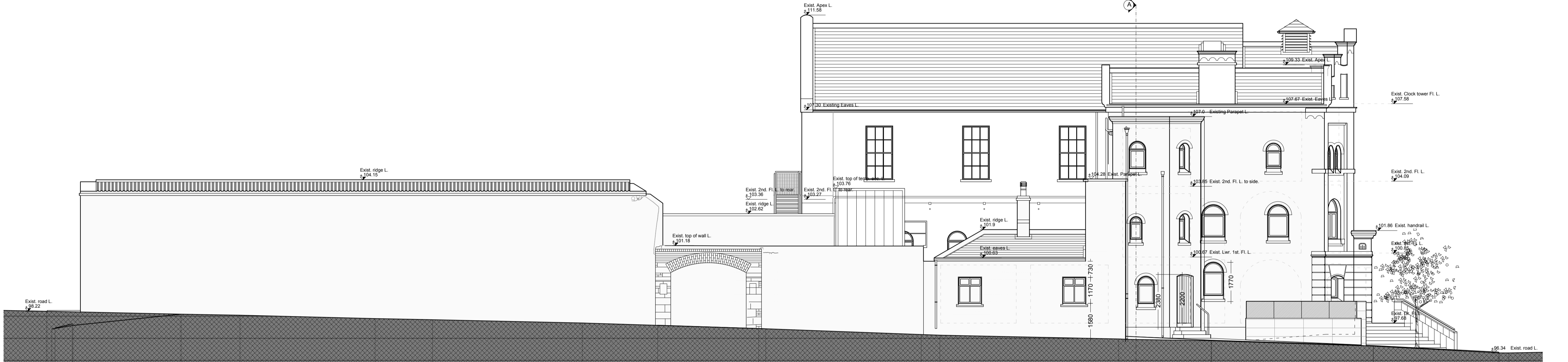
3 SIDE ELEVATION SCALE 1:100