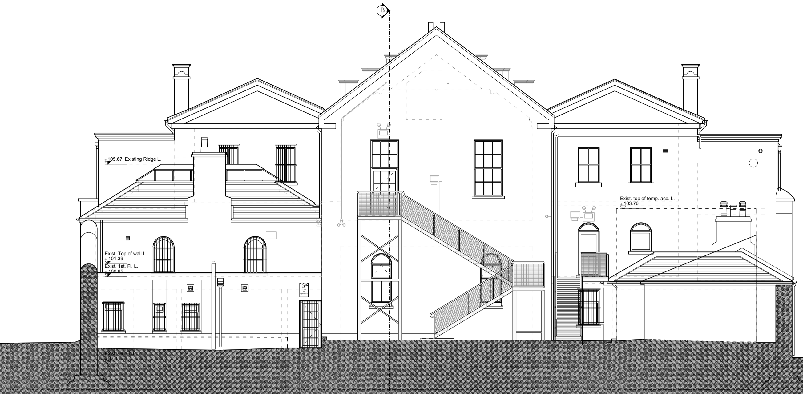
2 REAR ELEVATION SCALE 1:100